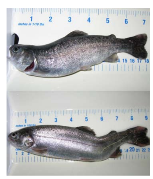
Examples of skeletal deformities observed in rainbow trout cultured within near-zero exchange RAS. Davidson et al., 2011. Aquacultural Engineering 45, 109-117.

In addition to its nitrate nitrogen measuring capabilities, the Pro Plus can be equipped with probes for a wide variety of other key water quality parameters, including dissolved oxygen (DO), conductivity, specific conductance, salinity, resistivity, total dissolved solids (TDS), oxidation reduction potential (ORP), ammonium, chloride and temperature. With