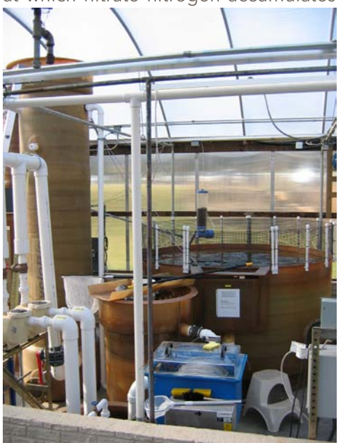
An individual RAS tank as part of the series of tanks used during this nitrate nitrogen study.

"Because nitrate nitrogen appears to be a much more critical water quality parameter than once thought, I think the Pro Plus with the nitrate probe could be an important monitoring tool for aquaculture system managers, particularly for those who operate RAS at low to near-zero water exchange rates at which nitrate nitrogen accumulates to relatively high