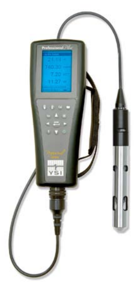
The YSI Pro Plus was used during the studies to acquire fast, simple field measurements of nitrate nitrogen.

"As soon as you start seeing behavioral changes, you've got to start thinking about fish welfare," he adds. The aquaculture industry is working hard to stay ahead of activist groups who are beginning -continued-