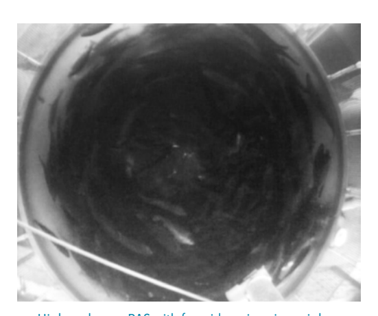
High-exchange RAS with few side swimming rainbow trout. Davidson et al., 2011. Aquacultural Engineering 45, 109-117.